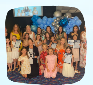
IB Dance Ball & Awards Night