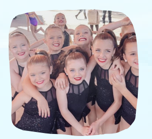
Shopping Centre Shows