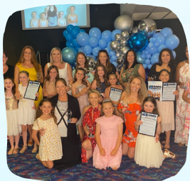
JB Dance Ball & Awards Night