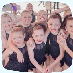
Shopping Centre Shows